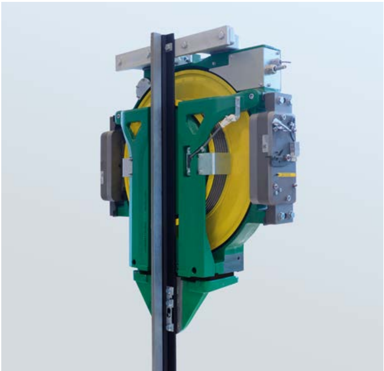
The eco-efficient KONE EcoDisc hoisting system

But the hoisting motor is not the only thing that can reduce the total energy consumption of an elevator. KONE has analyzed every function and option in order to reduce the total energy consumption.