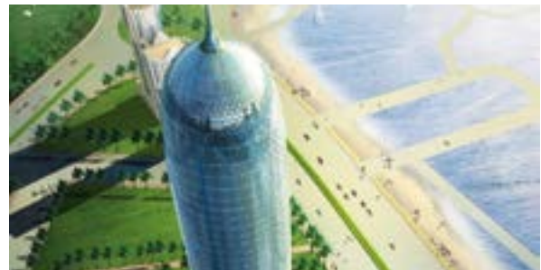
Doha High Rise, Doha, Qatar