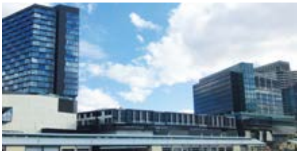
South Wharf, Melbourne, Australia