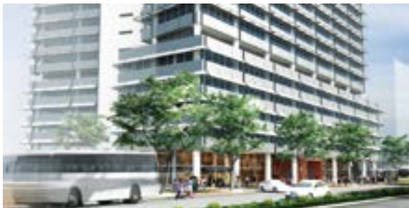
Centrepoint, Ho Chi Minh City, Vietnam