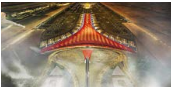
Beijing Capital Airport, Beijing, China