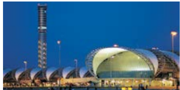
Suvarnabhumi Airport, Bangkok, Thailand