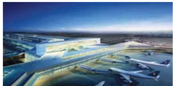
Hongqiao International Airport and Transportation Junction, Shanghai, China